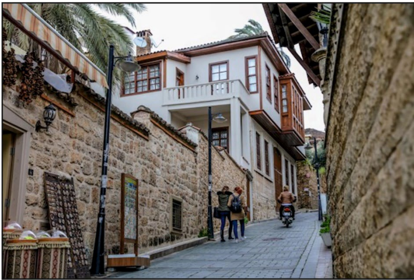
An avenue of the Inner Castle (Kaleiçi)