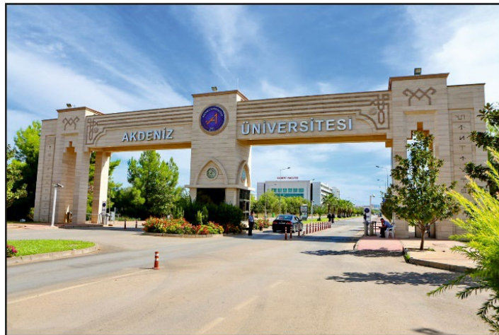
Main entrance of the Akdeniz University

We look forward to welcoming you to Antalya and hope that you will enjoy your stay in our city.