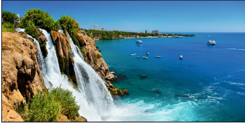
Lower Duden Waterfall in Antalya