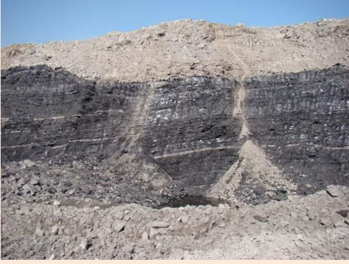
TUNÇBİLEK COAL MINE