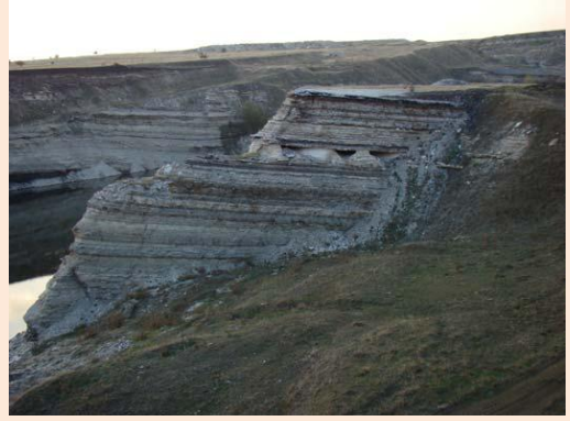
SEYİTÖMER COAL MINE